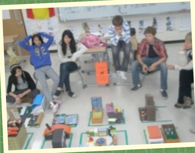
While the students are building their imaginary town, they are using their grammar skills in class.